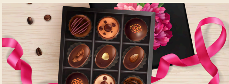
Custom & Luxury Chocolates Design & Gifting