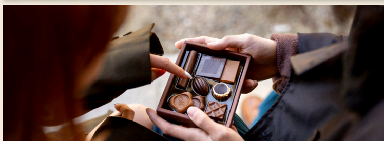
Event & Corporate Branding