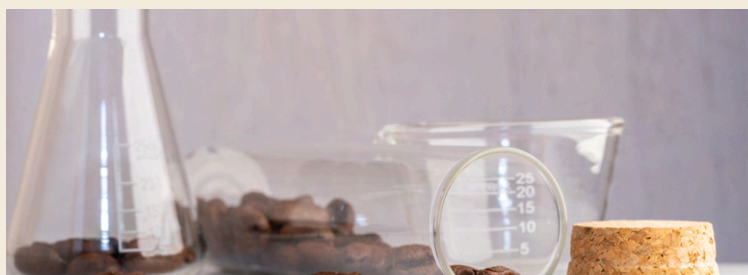
R&D and Food Innovation Labs